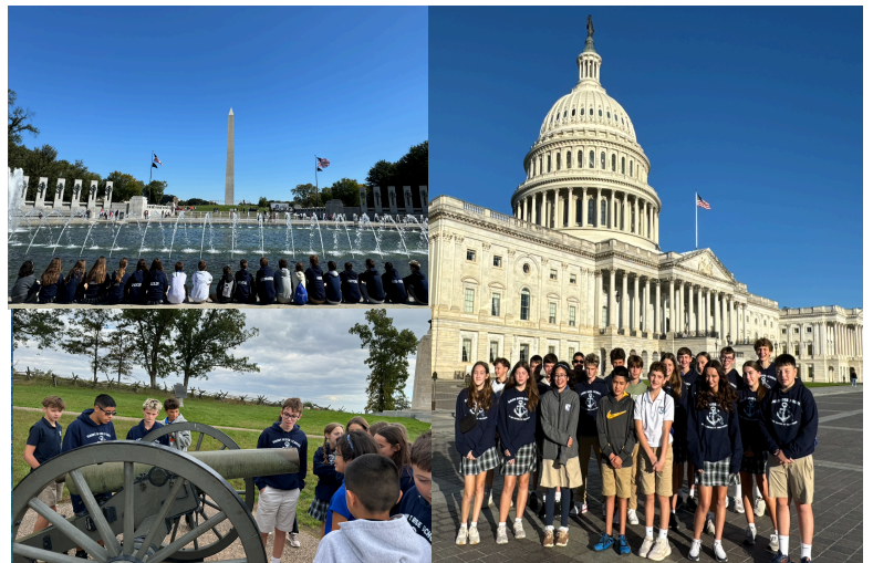
The eighth-grade students research national monuments and then take a class trip to Washington D.C. and Gettysburg