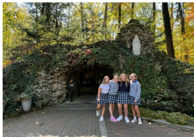
Sixth grade participates in an all-day retreat in the fall and sixth grade camp in the spring.