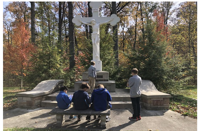
6th Grade participates in an all-day retreat in the fall and 6th Grade Camp in the spring.